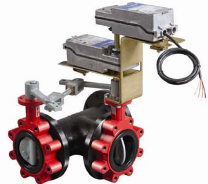
Three-Way Valve with M9000 Series Electric Actuator (without Weather Shield)